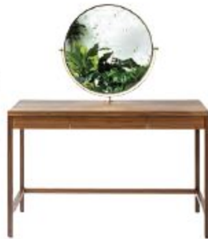
Le Mans dune-ny.com

"Although not a traditional desk, this vanity has all the fixings of a typical desk and has an added feature of a mirror. In spaces where more than one function must exist a vanity that can also be used as a desk is an excellent option. The beautiful solid wood table can easily be integrated into a bedroom or dressing room."