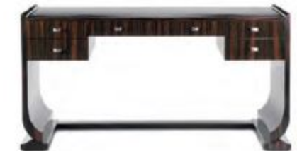
Leu Leu Quintus Collection dennismiller.com

"This desk has classic deco styling and a beautiful finish that can soften the edges of any room."