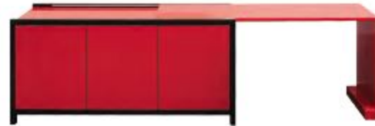
Sheet by Dimore Studio thefutureperfect.com

"The Le Mans from Dune furniture is a fantastic multipurpose piece that allows for expansion when needed but can be fully closed to just look like a dresser. The amount of storage it has is amazing for either clothing or papers."