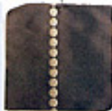
CONCRETE IMPRESSION 100% COTTON, 100% WOOL

"This fabric brings a wonderful mix of textures and colors to the sofa. It would break up all the pattern and give the eye a fantastic mix." SCHUMACHER MATTHEW P. SMYTH See page 106