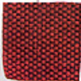
CONCRETE WILLOW 100% COTTON, 100% WOOL

"It's natural for someone that long spent at the school to have an elegant classic affect. So we did a classic fabric. It's actually based on a fabric that pattern house in Paris." SCHUMACHER See page 106