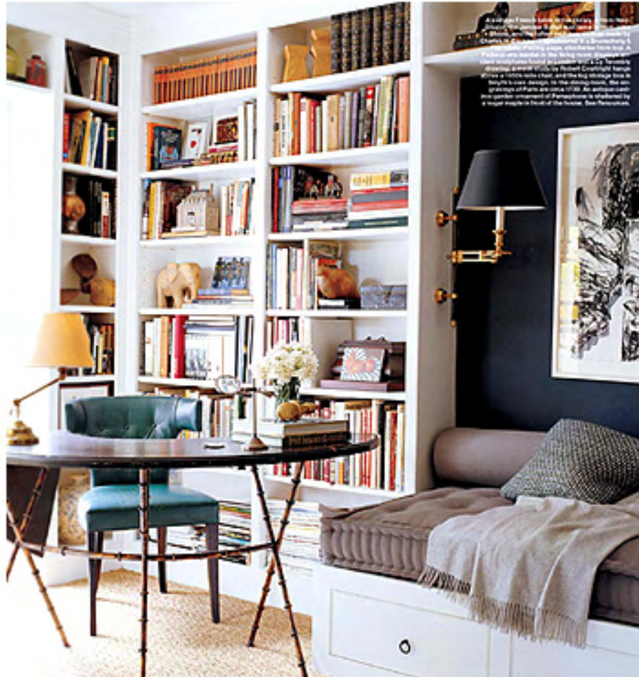
A round wooden table, a green leather chair, a brass lamp, and a framed abstract artwork are featured in this room. The room is a blend of modern and traditional design, with a focus on functionality and style. The bookshelf is a key element, providing a space for reading and display. The overall aesthetic is clean and sophisticated.