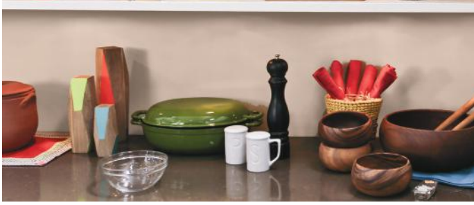
A mix of bright ceramics and antique wooden objects captures the spirit of the island.