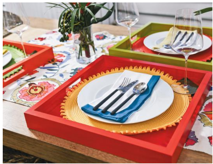
Brightly colored table accents invoke the vibrant Caribbean feel of Puerto Rico.