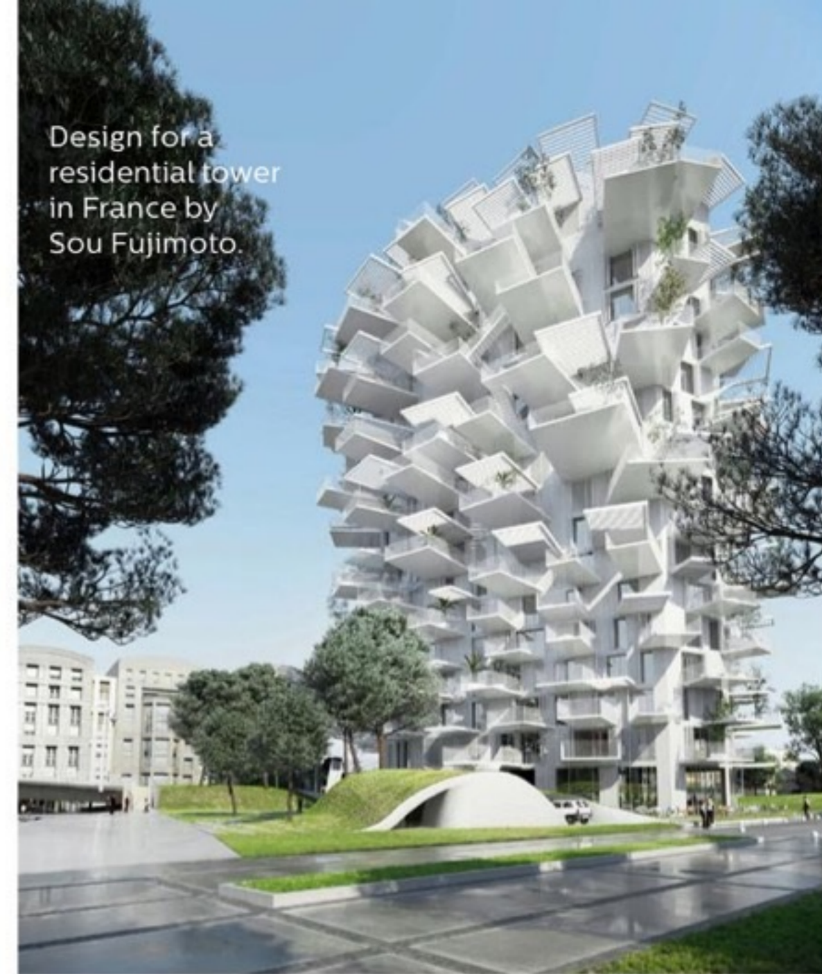
Design for a residential tower in France by Sou Fujimoto.

"What was modern once can be modern again—no matter the decade, or even the century—if it's beautiful, well-designed, and well-crafted. I'm a fan of Dutch designer Aldo Bakker. His work transcends periods and styles with items that are unique, practical, and elegant."