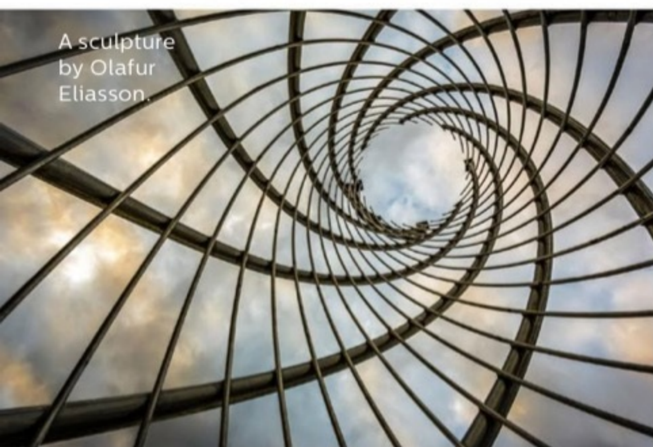
A sculpture by Olafur Eliasson.

We asked some of the world's top designers and architects to share what they think defines modernism today. Their ideas range from new architecture to antique furnishings, and from social trends to a favorite app