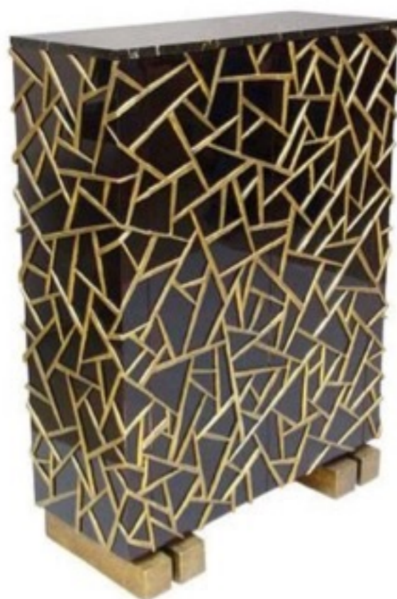
Hervé Van der Straeten's Resilles cabinet.

"Modernity is staying up-to-date even in the face of enormous amounts of information. The Brazilian architect Oscar Niemeyer flirted with the curves of modernism and created a revolution when he began using reinforced concrete, a material that was absolutely avant-garde. An undeniable modern resource these days is Instagram. I take pictures, edit them, crop them, choose a nice filter, and share. I can't think of anything more modern than that."