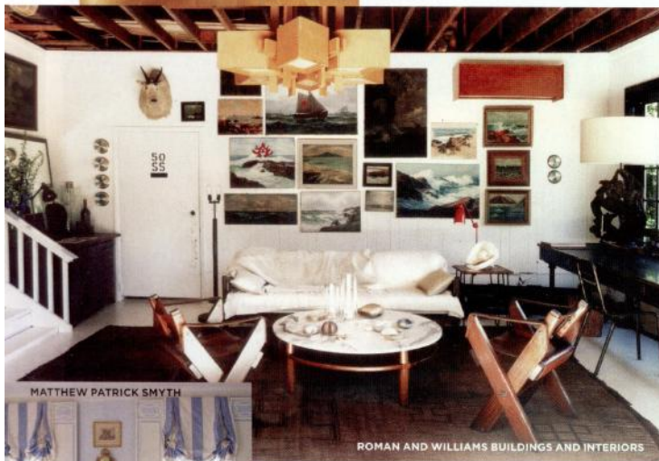
MATTHEW PATRICK SMYTH

TRADEMARK: Visually dynamic experience of a fresh, modern aesthetic with sophisticated materials and luxurious finishes