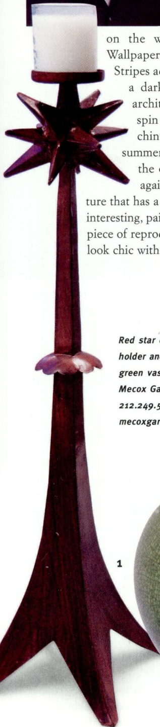
Red star candleholder and ceramic green vase, both Mecox Gardens: 212.249.5301 or mecoxgardens.com .

1. Reassess your accessories! Replace old candlesticks with fresh, fun, new ones from Mecox Gardens in a bright color. Remember to throw out old candles. They don't age well and can look sad and dirty when left out too long. 2. Paint bookshelves and trim with Benjamin Moore "White Dove" and use Janovic #141-A "Chocolate Brown" on the walls. Think of '60s Hicks. 3. Wallpaper can hide a multitude of sins. Stripes add height, a scenic paper opens up a dark room, and a toile camouflages architectural defects. 4. Slipcovers can spin a room around. Adding canvas or chintz slipcovers in the spring and summer can lighten a room and come fall, the original upholstery will look fresh again. 5. If you have a piece of furniture that has a good line but the finish is not very interesting, paint it glossy black. Many a mediocre piece of reproduction furniture from the '50s can look chic with a good coat of black paint!